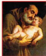
St. Felix of Cantalice, the First Capuchin Saint

During the first century of its existence, the Order of Friars Minor Capuchins was also a school of sanctity for many friars. Among its prominent figures during this period we mention St. Felice of Cantalice (+ 1587), St. Laurence of Brindisi, Doctor of the Church (+ 1619) and St. Fedele of Sigmaringen (+ 1622), the first Martyr of Propaganda Fide.